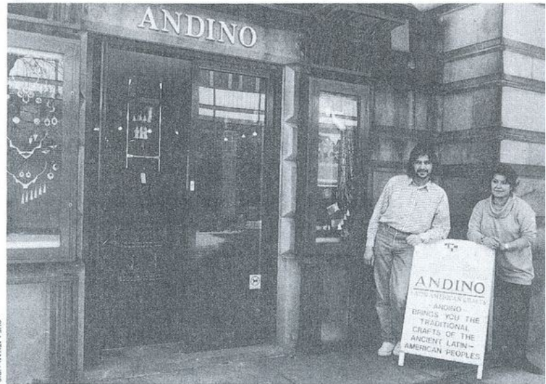
Members of Andino Co-operative outside their shop.

This has meant hectic buying trips to craft workers in Mexico, Chile, Guatemala and Colombia. Andino deals directly with the craft workers in the country of origin where possible to ensure that fair prices are paid to the producers rather than lining the pockets of agents. This policy also helps the co-op to provide its customers with a wide range of authentic craft items at very reasonable prices. Andino has received assistance from the Co-operative Development Group, both with business advice and help in obtaining financial backing for the co-operative.